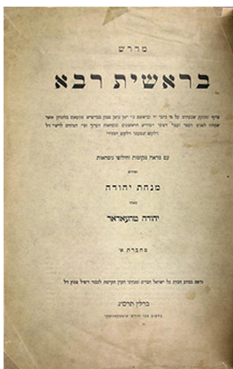
Photograph 9: The cover page of the first fascicle of Beresbit Rabbab , Berlin 1903

signed the first fascicle: Bojanowo, Prov. Posen, Januar, 1903.