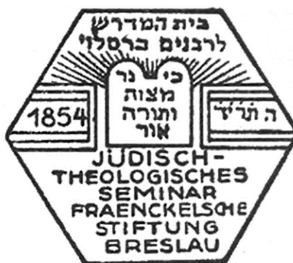
Photograph 2: Symbol of the Breslau Rabbinical Seminary