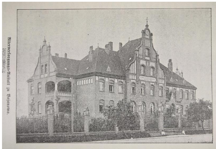
Photograph 8: Jewish home for the aged in Bojanowo