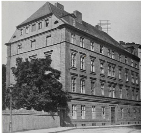
Photograph 4: The Breslau Rabbinical Seminary building in 1904

Following seven years of study, students took oral and written exams in order to receive התרת הוראה ( battarat hora'ah , i.e. ordination certificate). 23 The future rabbis were required to prove their skill as halachic decisors in practical areas such as marriage and divorce, the laws of כשרות ( kašrut ) and שחיטה ( šehitah ) and marital laws.